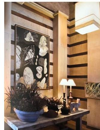
Images from Leo Adams Art Home